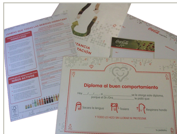
Figure 1. Promotional material delivered by a Coca-Cola representative to professionals in a public health center located in the southern area of the Autonomous City of Buenos Aires, Argentina.

Moreover, companies fund the conferences of scientific societies in exchange for physical space (displays) to promote their products among attending professionals, and, in some cases, for inclusion in the scientific programming of the event. This type of links between companies and scientific societies becomes still more problematic with the endorsement of specific products, allowing the use of the organization logo to reinforce nutritional claims for advertising purposes. One example is the recent endorsement of the Argentine Society of Nutrition [ Sociedad Argentina de Nutrición ] of the dairy product Danonino for children. (48) Although the product is fortified with micronutrients, it has an excessive content of free sugars and saturated fats (28% y 17% of the total caloric value, respectively), as evidenced by