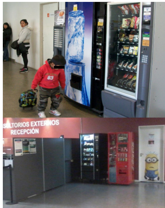
Figure 2. Vending machines of sugar-sweetened beverages (not including water in spite of the image) and sugary snacks in waiting rooms in two health care centers, public and private, in the Autonomous City of Buenos Aires, Argentina.

These links between the food corporations and professional health care associations and institutions (funding of scientific research works and events, endorsement of