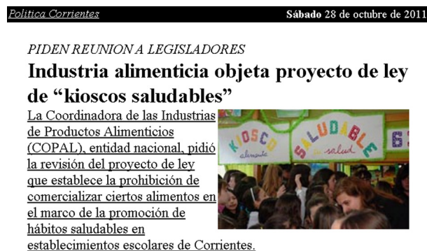
Figura 3. Article in a local newspaper describing the reaction of the food industry to the law regarding school kiosks in the province of Corrientes, Argentina.

The result is worrying: in 90% of Argentine jurisdictions that have a regulation concerning the sale of foods and drinks in schools, “healthy kiosks” refer to kiosks that maintain the offer of sugar-sweetened drinks and snacks with high contents of fats, sugars